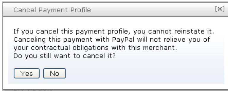
FIGURE 1.4 Cancel Recurring Payments Profile

If the user clicks Yes , the profile is cancelled.